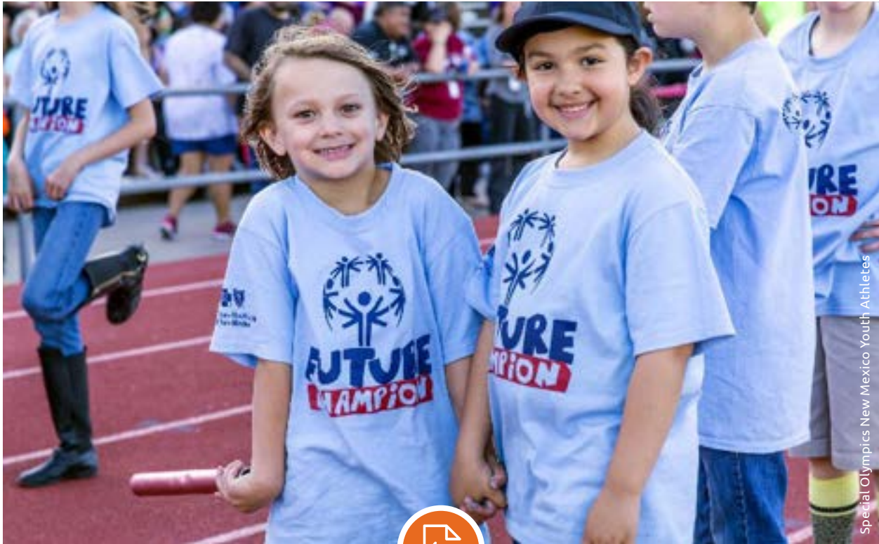
Special Olympics New Mexico Youth Athletes