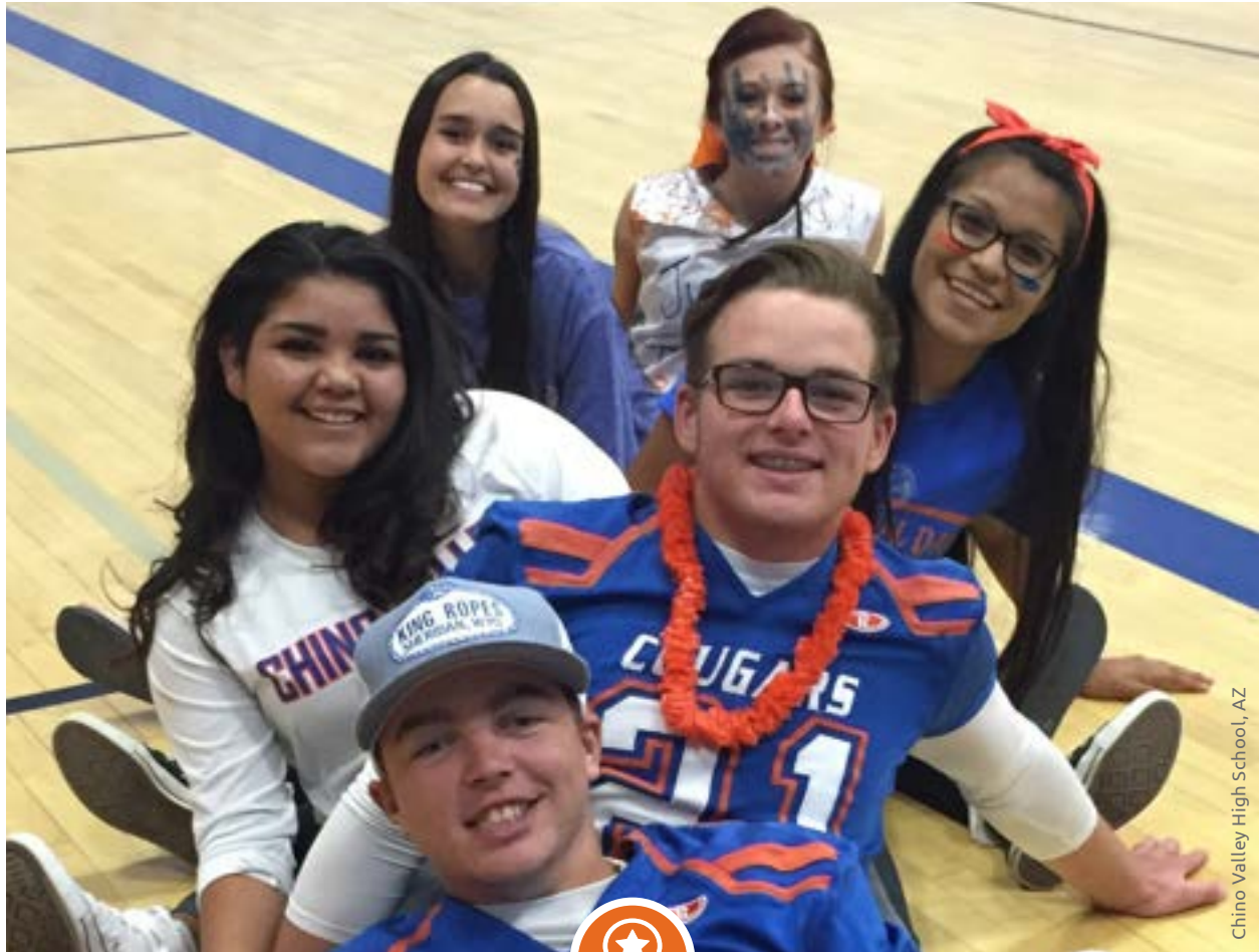
Chino Valley High School, AZ