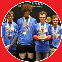
FAMILY The Gillihan Family, Area 8