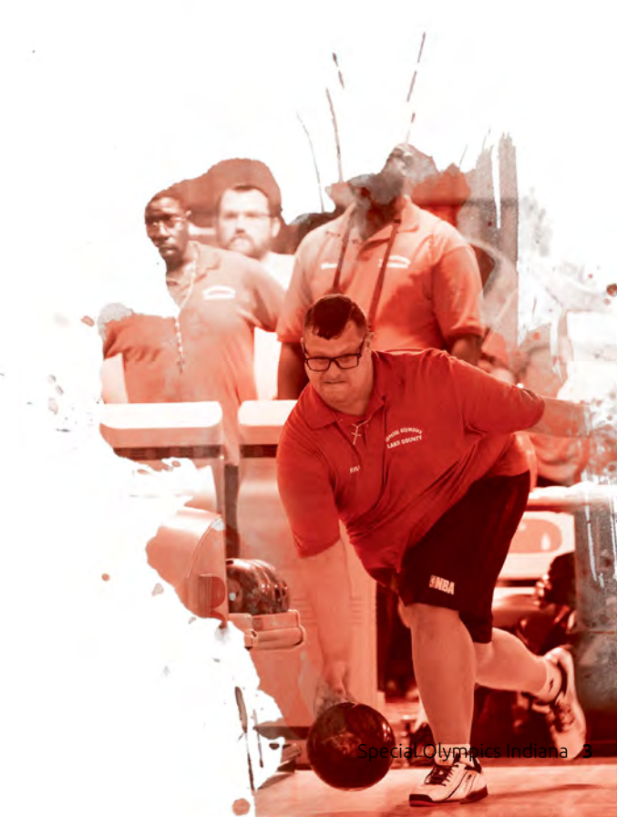
Special Olympics Indiana 3

12 DECEMBER: Bowling proves once again to be our most popular sport, as more than 3,700 athletes from across the state vie for medals at the 2019 State Bowling Tournament in Indianapolis.