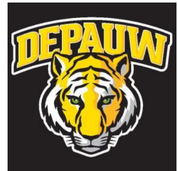
DePauw University, DePauw Athletics, and DePauw SAAC