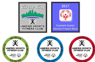
Recognition for individual miles accumulates from year-to-year

Collect all the Unified Fitness Club pins as you achieve each mileage plateau.